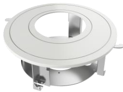
DS-DS-1227ZJ-DM42 In-Ceiling Mount